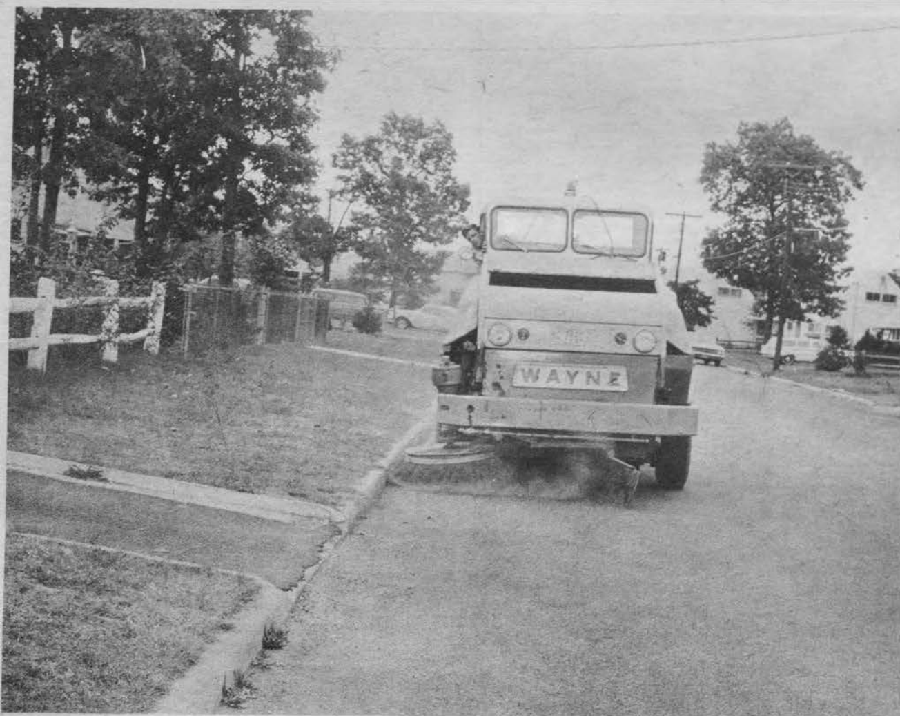
SWEEPING UP: Madison Township Road Sweeper shown here in operation in the Southwood development. Use of the sweeper

The road department acquired a pair of storm sewer cleaners, these have been put to use cleaning debris and dirt from the miles of storm sewers in the township.