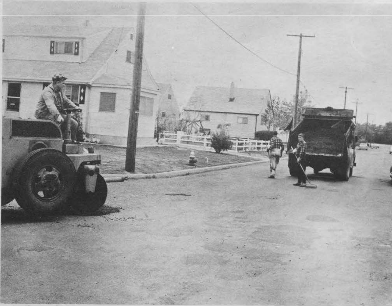
PATCHING UP: Township Road Department employees patch "pot holes". The roller presses the material into the holes. Ac-