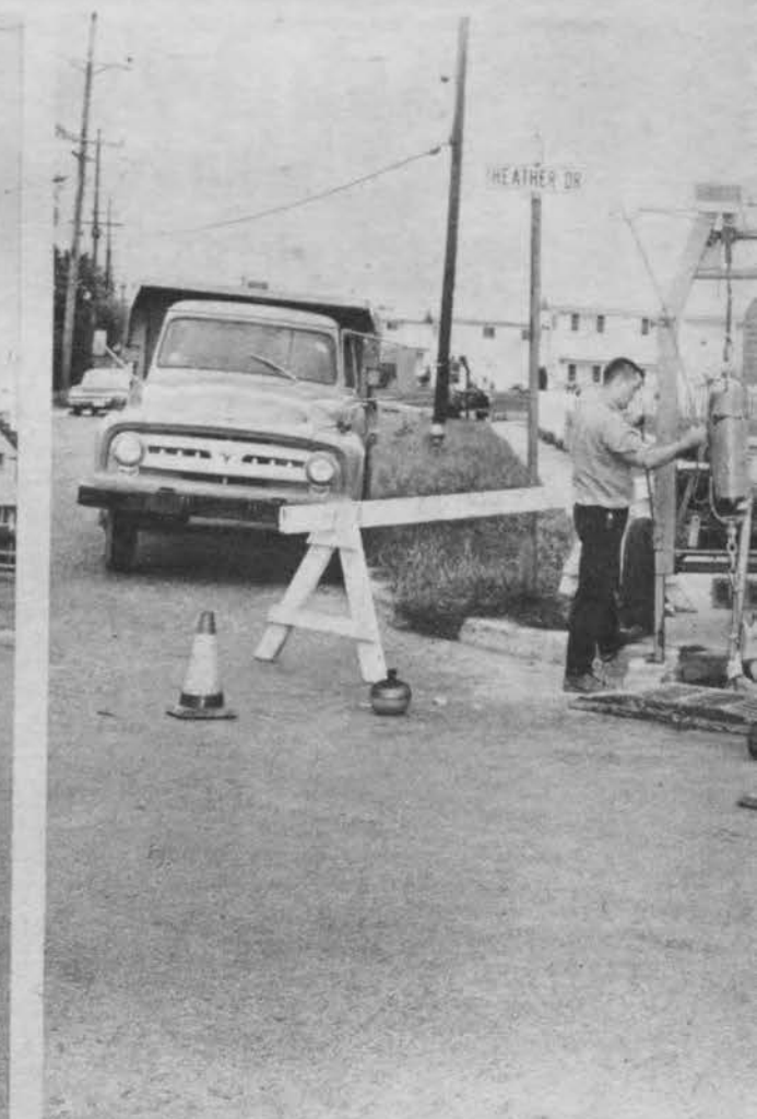
IT'S CLEAR NOW: Road department workmen prepare to remove storm debris has been found in storm cleaning equipment from Sayre Woods South Street. All

managed to remove tons of litter and other debris.